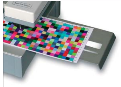
Extractable support for large targets