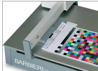
Robust transport unit